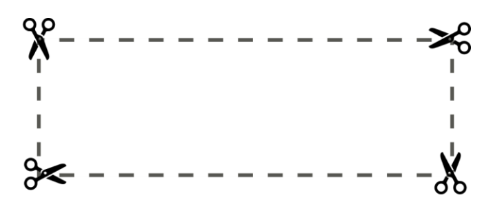
Cut the box & Sign within the box

1) The major reasons for rejection of signatures are "miniature" signatures. Candidates are advised to cut the box and then sign within the box such that signature occupies at least 80% of the box.